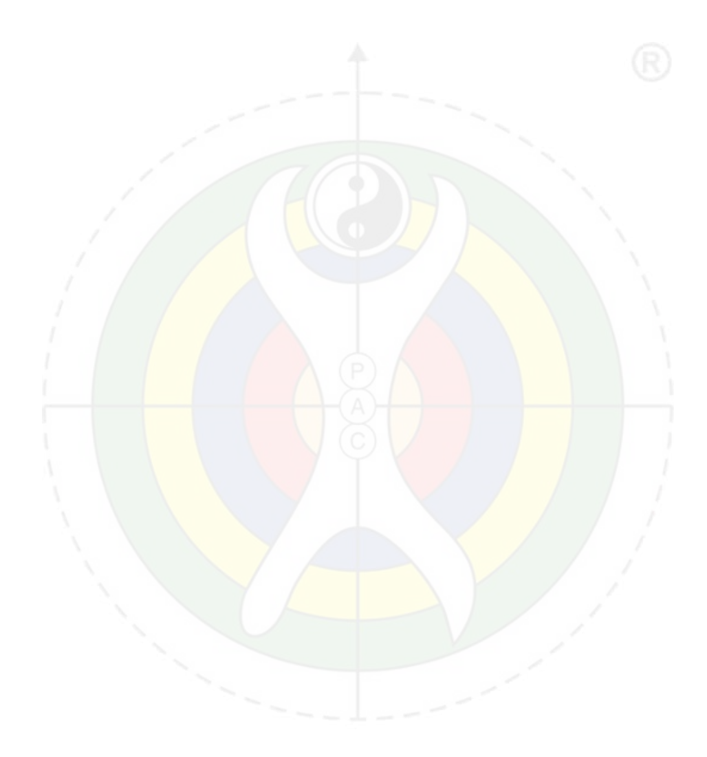
NG HOLISTIC WELLNESS n COMPETENCIES